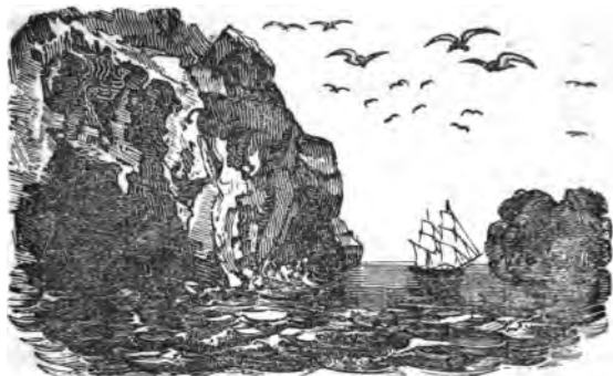
Arrival of the brig Lydia , at Nootka Sound.

lives, depended on our conducting ourselves so as to induce the natives to suppose we were not very anxious to leave them. We continued our works as if nothing had happened, when in a few minutes after, Maquina came in, and seeing us at work appeared much surprised, and asked me if I did not know that a vessel had come. I answered in a careless manner, that it was nothing to me. How, John, said he, you no glad go board. I replied that I cared very little about it, as I had become reconciled to their manner of living, and had no wish to go away. He then told me, that he had called a council of his people respecting us, and that we must leave off work and be present at it.